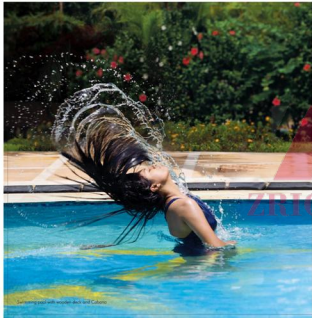
Swimming pool with wooden deck and Cabana